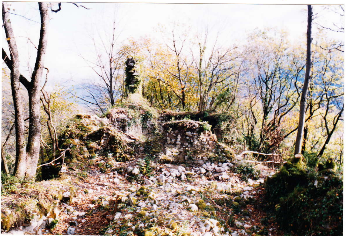
under these stones, 300 years are waiting after us