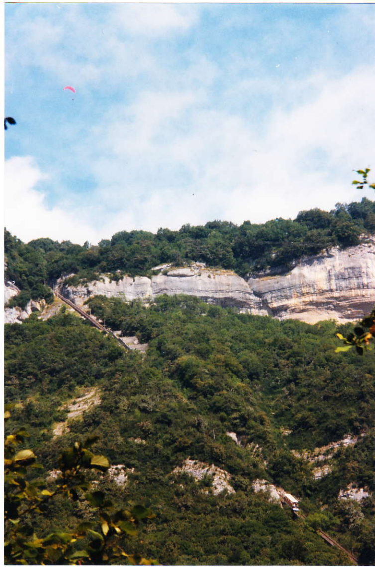
Can you imagine the footpath climbing up the mountain used by ox and wagon