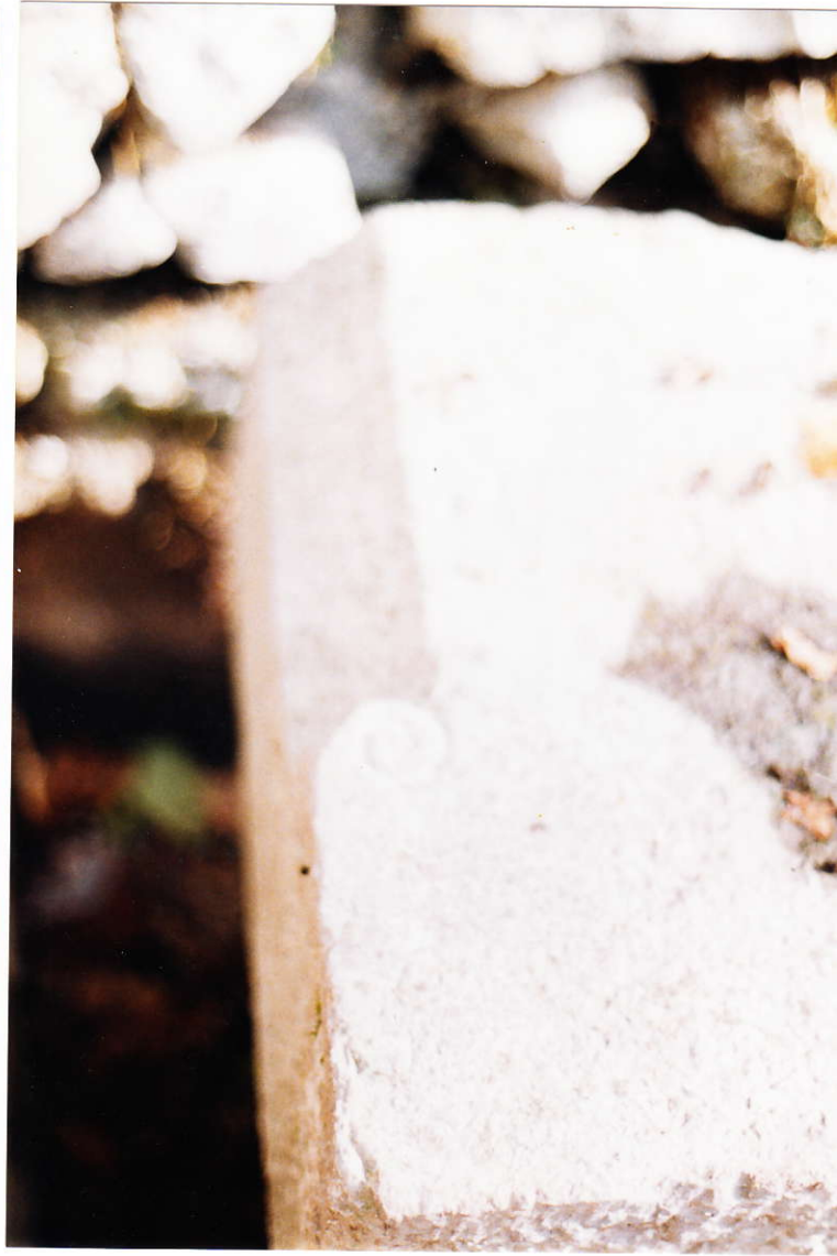
a teaching detail