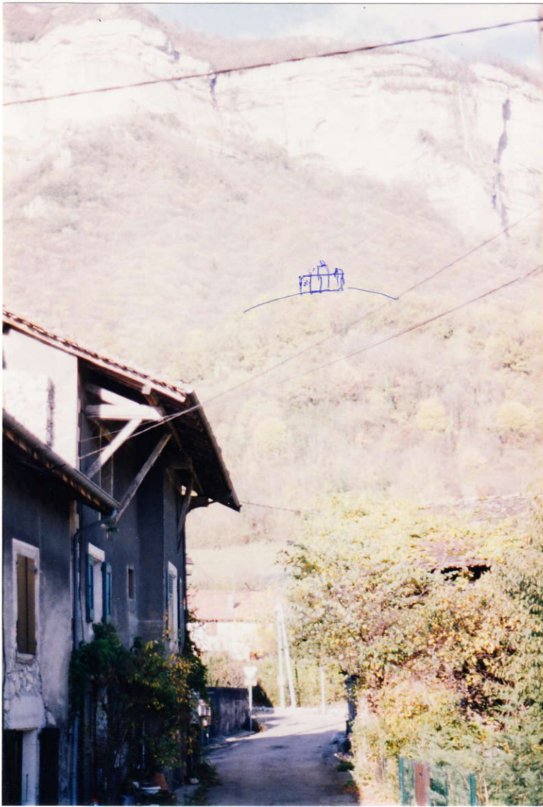
The castle's hill seen from Montfort village